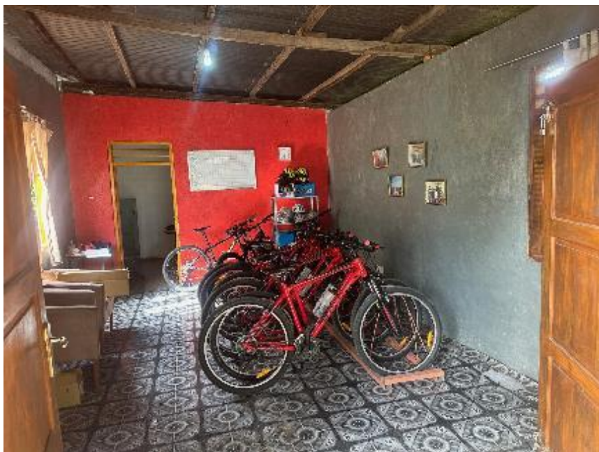
Bikes serviced, parts replaced – ready to go!