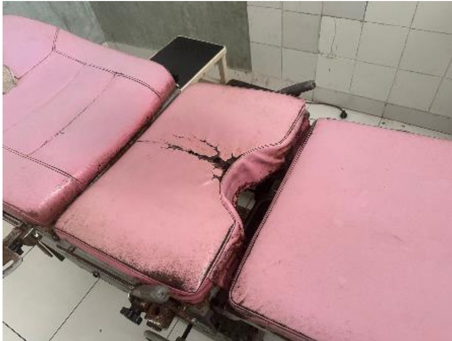
Birthing unit bed – you can imagine what has seeped through those cracks ...