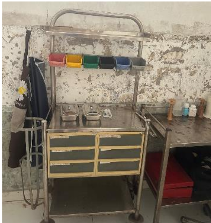
Birthing Unit medicine cabinet – almost empty. State of walls!