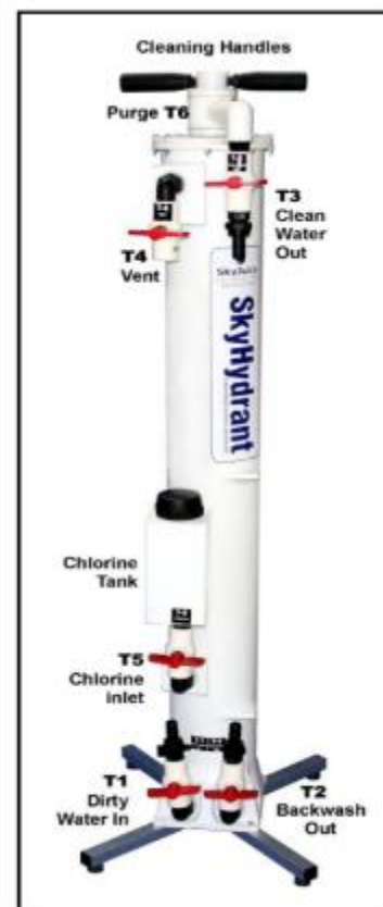
A SkyHydrant filtration unit:

The plan is to install a number of "Sky Hydrant" water filtration systems. These systems have an "ultrafine" filter membrane, and rely simply on gravity-fed water from a "dirty water tank".