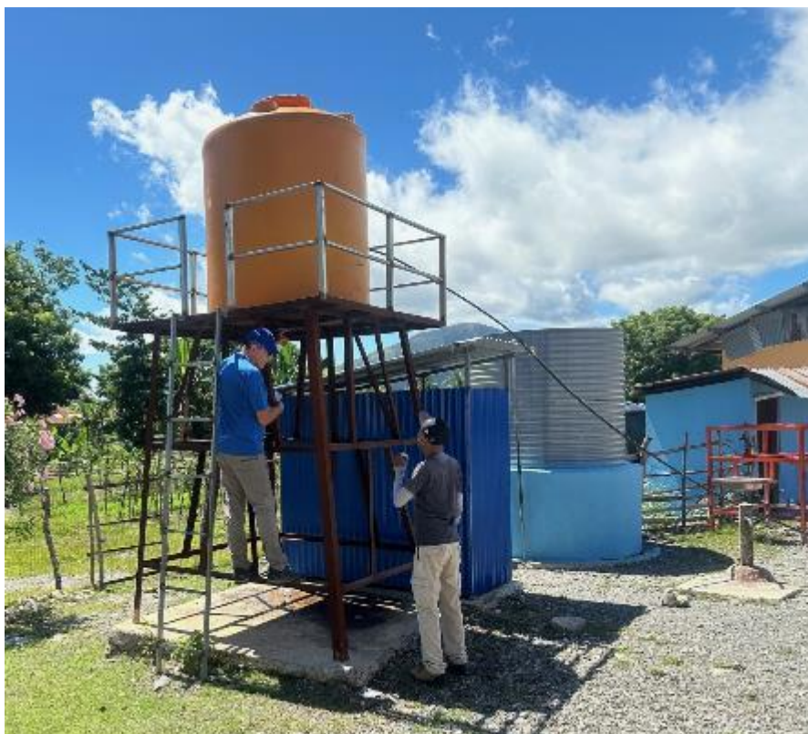
Existing layout at Palaka School

Water is pumped up to the “dirty water” tank on the steel tank stand, then gravity-feeds down to the Sky Hydrant (housed in the blue colorbond building), and from there to the clean water tank. From there, the clean water is distributed to community water points,